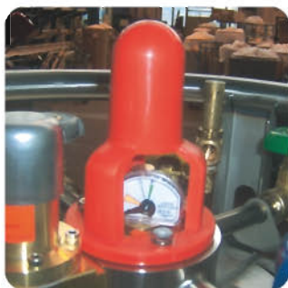
The Roto-Cal™ gauge features an easy-to-read dial liquid level indicator with swivel head design.

**** Tank plus product at saturated pressure 0 bar for O 2 , N 2 , Ar and triple point for CO 2 and N 2 O