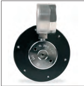
Rear inlet view